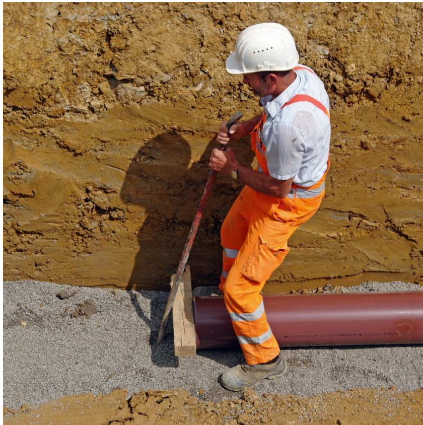
HS Pipe is easy to move into position due to its light weight

Although the tight access and low-lying nature of the site were contributory factors, the main reason DAB selected the Funke HS® Pipe system in preference to vitrified clay as specified on the drawings was the health and safety benefits of HS® Pipe over vitrified clay due to its lower weight and ease of handling.